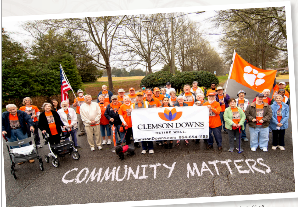
Clemson alumni, retired professors, veterans, Clemson Downs residents, and staff all coming together to represent one group - our community.

Nonprofit Org. U.S. POSTAGE PAID Clemson, SC Permit No. 10